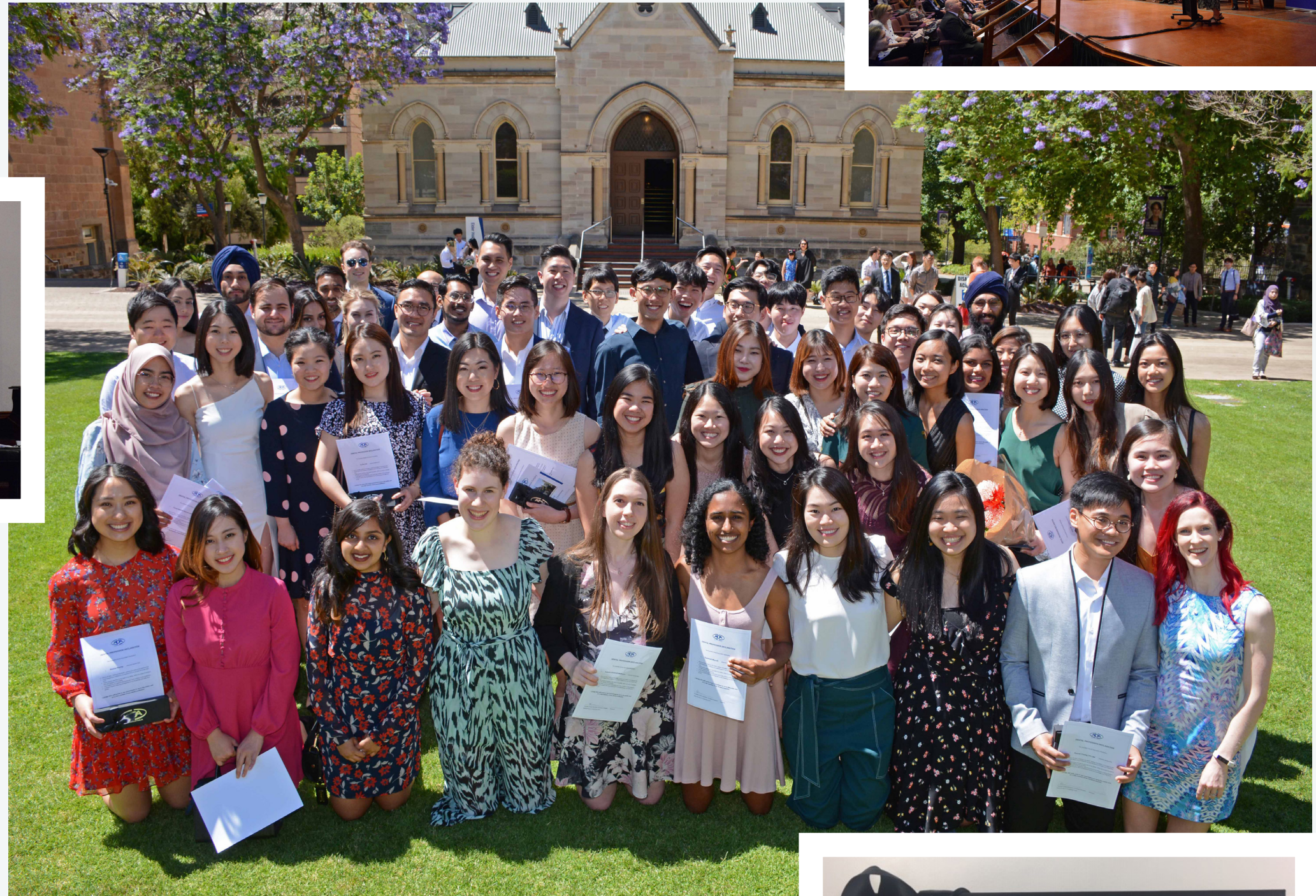
Main Picture: Graduating Class of 2019

ADASA would like to acknowledge and thank our business partners BOQ Specialist and Guild insurance for their support of the event along with Dentavision Australia.